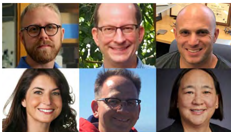
2020 SEED Award recipients