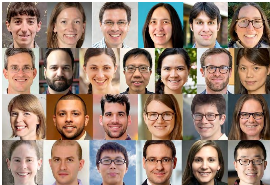
2020 Cottrell Scholars