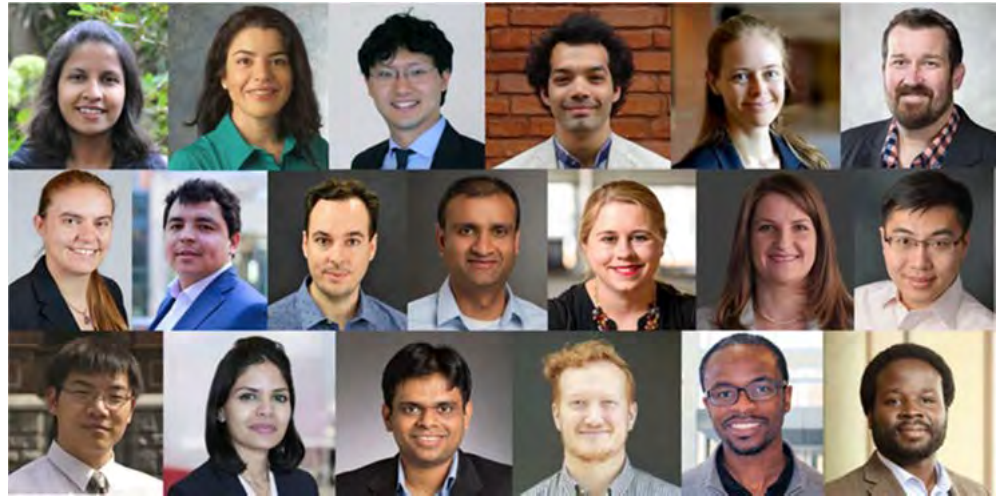
2020 Scialog: Negative Emissions Science Collaboration Innovation Award recipients

Goal: To catalyze chemists, engineers, environmental scientists and those in related fields to collaborate on new and innovative projects to accelerate breakthroughs in the fundamental understanding of capturing and utilizing or sequestering carbon and other greenhouse gases in the atmosphere and oceans that will lead to a sustainable future. Each of the 21 individual awards is $55,000.